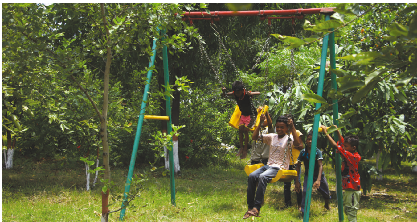
Children playing inside Kayakalp Vatika developed in Piparwar area of Central Coalfields Limited in Jharkhand