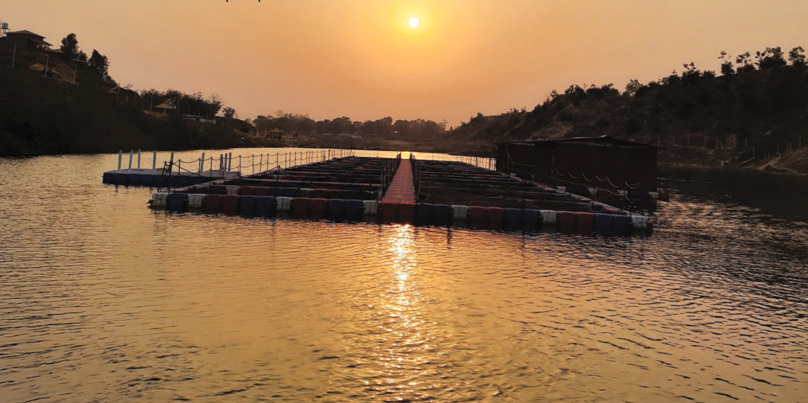
Kenapara eco-tourism site developed in Bishrampur area of South Eastern Coalfields Limited in Chhattisgarh