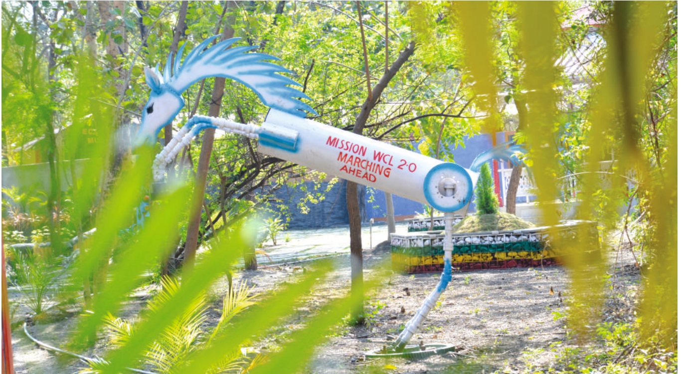
Mahatma Gandhi eco-park at Nagpur area of Western Coalfields Limited in Maharashtra