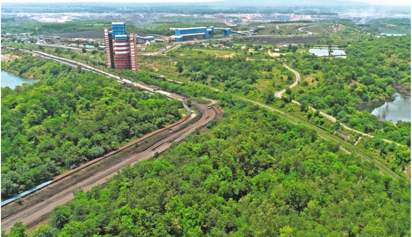
Greenery created around a coal handling plant in Bharatpur area of Mahanadi Coalfields Limited in Odisha