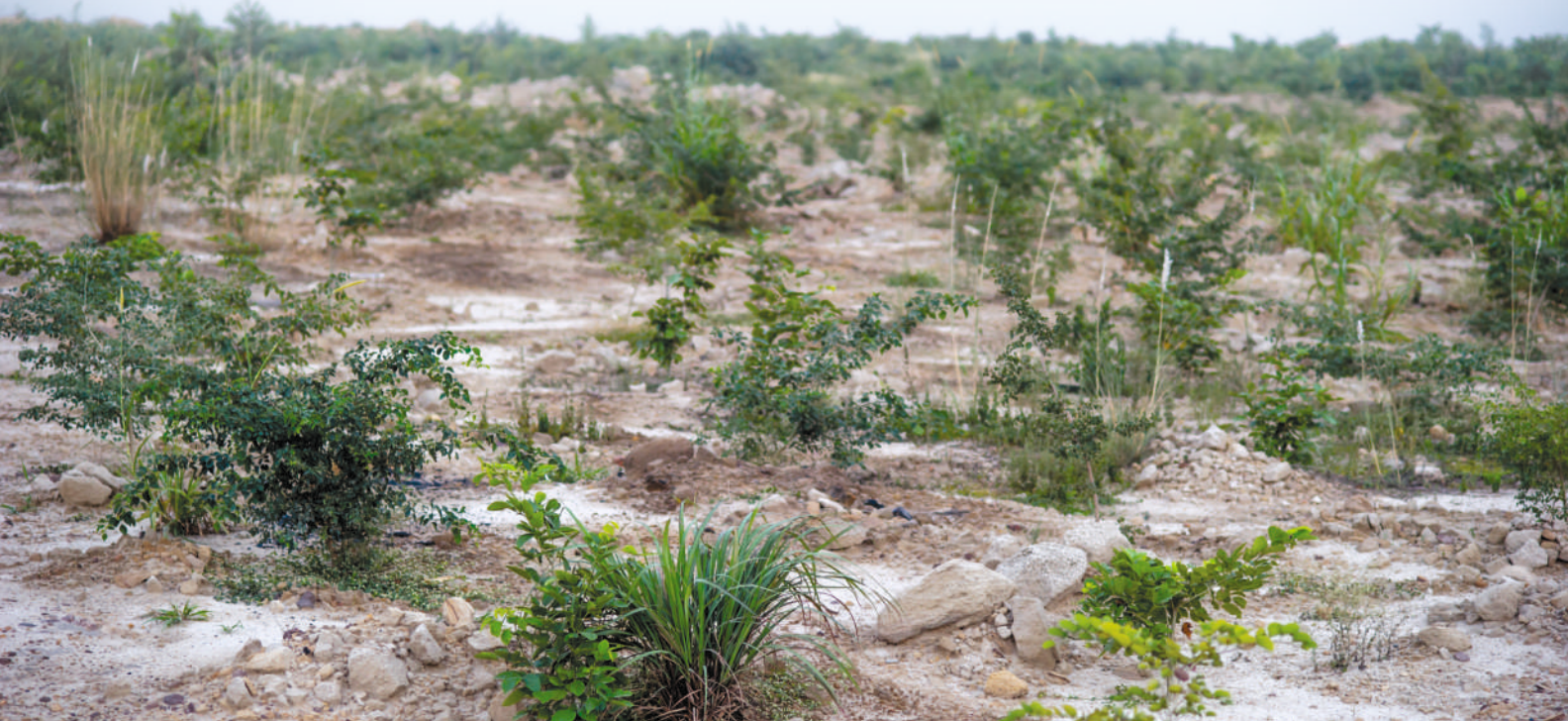
Plantation on an overburden dump in Amlohri area of Northern Coalfields Limited in Madhya Pradesh

CIL has been suggested that Special Spot e-auction / Spot e-auction windows of CIL may be used to sell coal for the purpose of export. Further, the coal which cannot be utilized / sold in the domestic market should only be exported. CIL can also participate in the tenders floated by the neighbouring countries to export coal after meeting the domestic demand. Further, the traders / coal consumers of the neighbouring countries can also participate in the Special Spot e-auction / Spot e-auction windows of CIL.