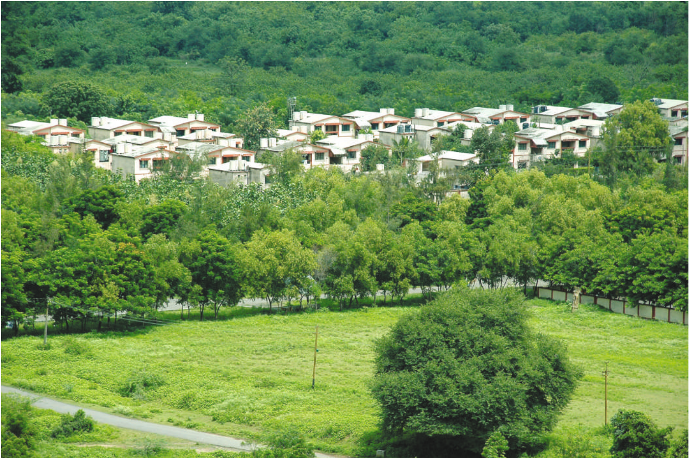
Residential colony at PENCH area in Western Coalfields Limited, Madhya Pradesh