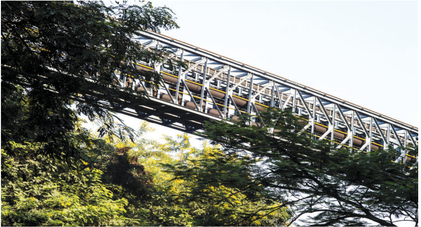
Coal transportation using eco-friendly belt pipe conveyor in Krishnashila area of Northern Coalfields Limited in U.P.