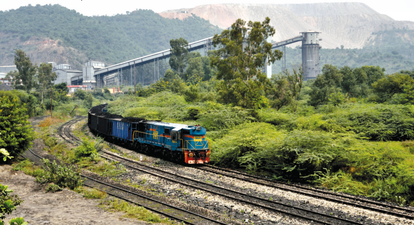
Coal transportation using merry-go-round in Amlohri area of Northern Coalfields Limited in Madhya Pradesh