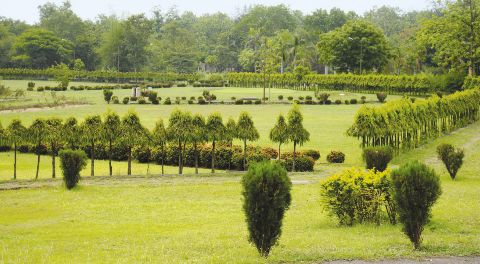
An eco-park developed at Jagannath area of Mahanadi Coalfields Limited in Odisha