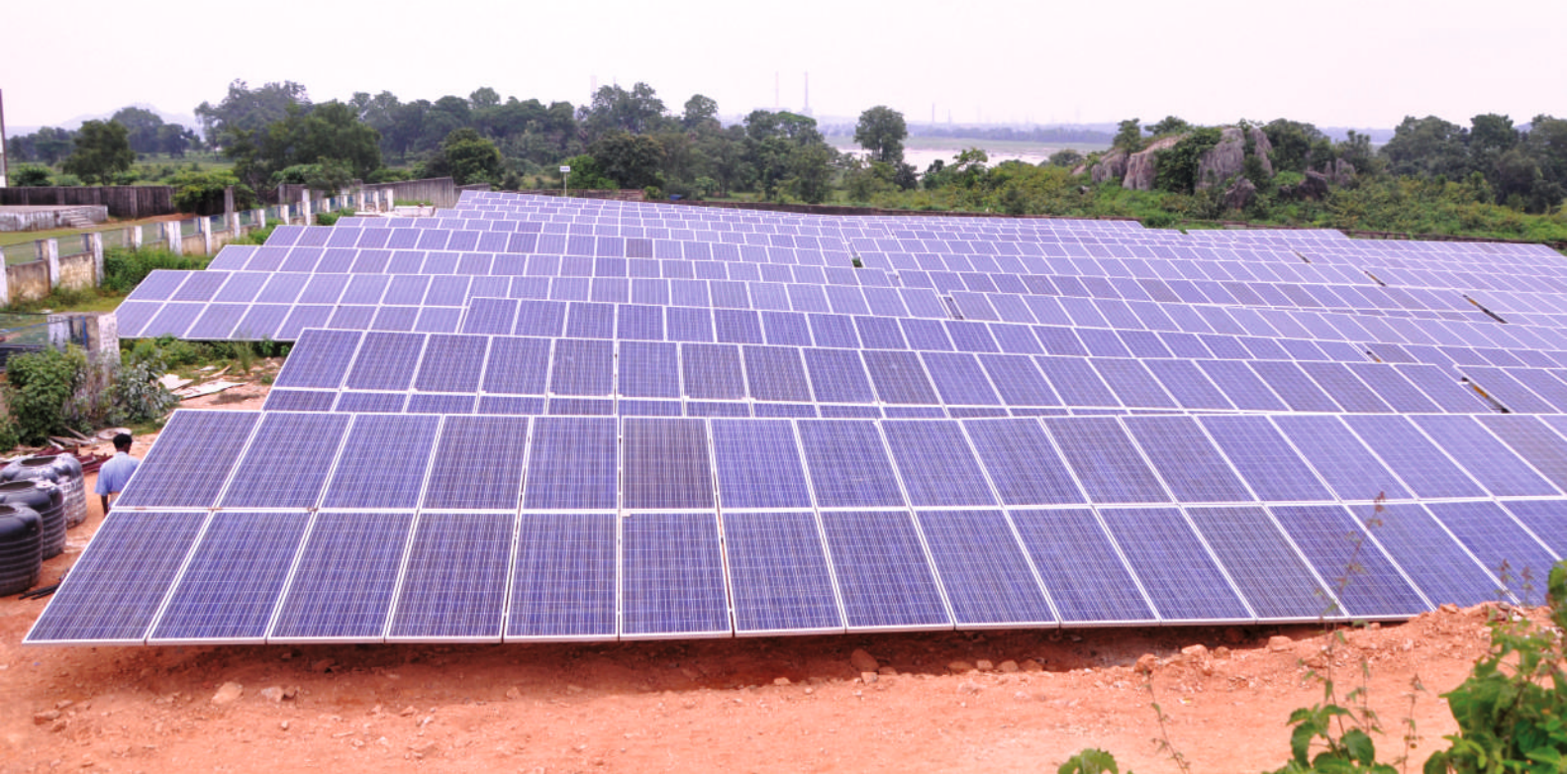
A solar power plant at Mahanadi Coalfields Limited in Sambalpur, Odisha