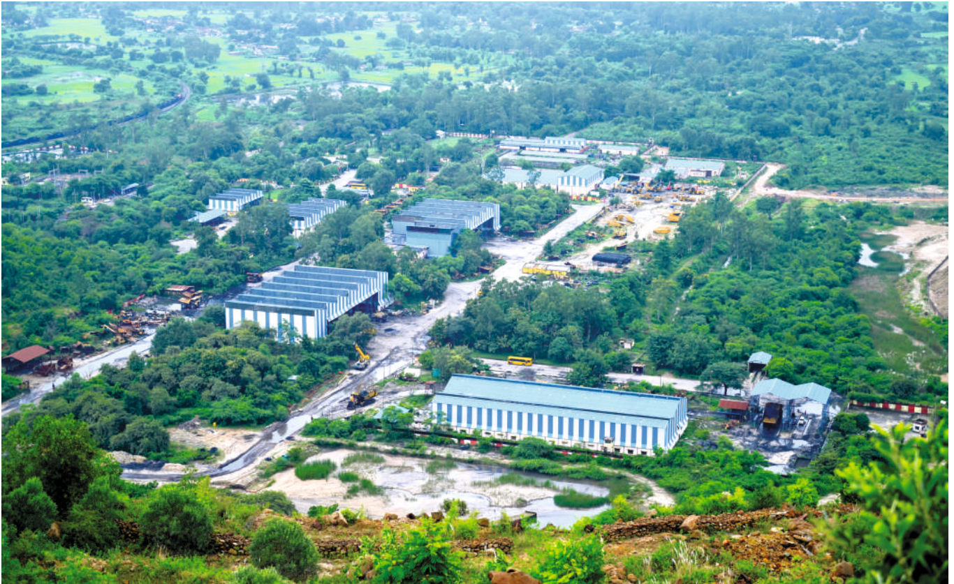
Lush green Nigahi coal mine of Northern Coalfields Limited in Madhya Pradesh