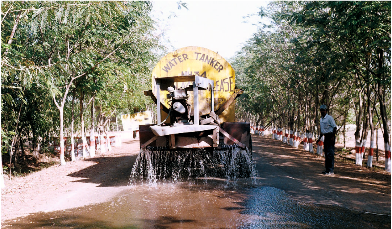
Dust suppression using a water sprinkler at Wani area of Western Coalfields Limited in Maharashtra