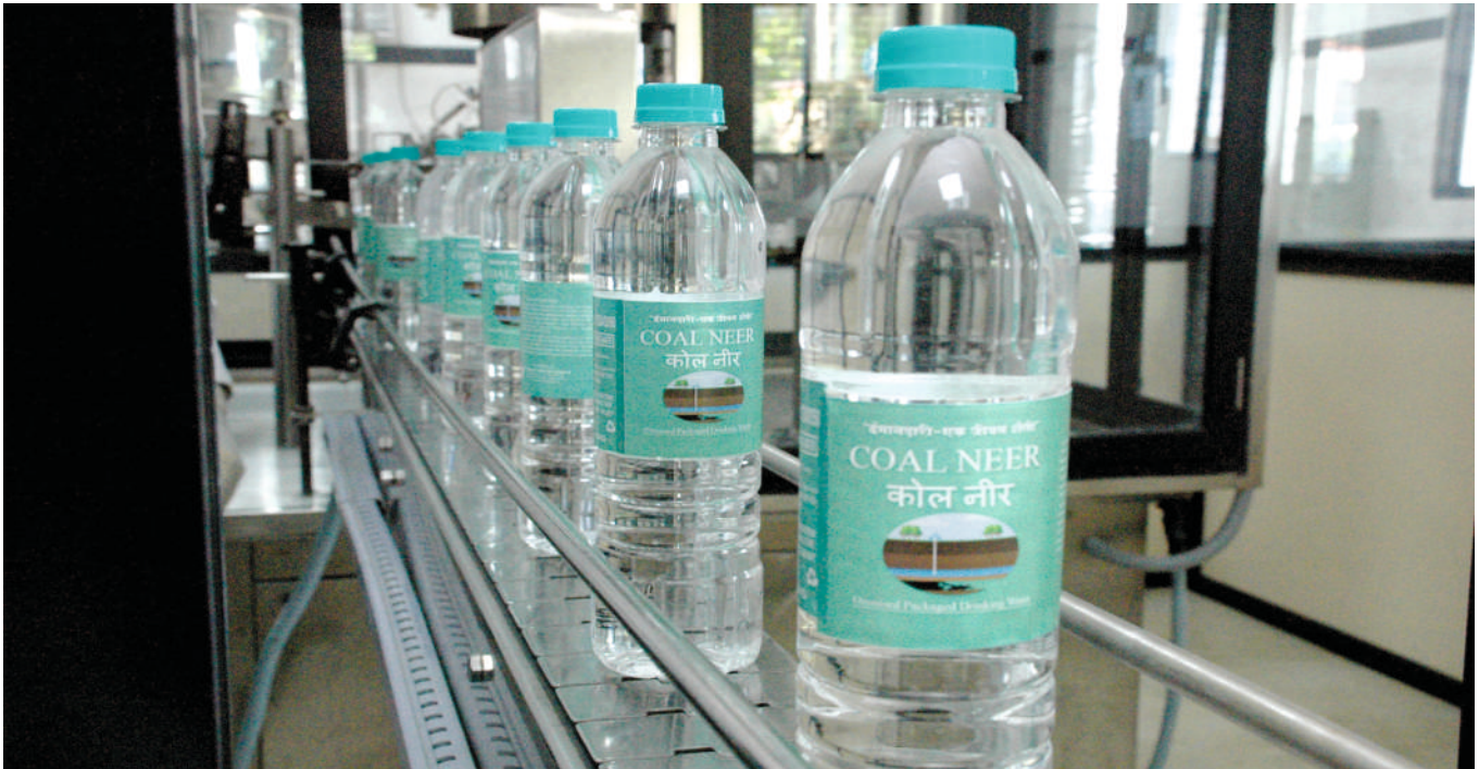
“Coal Neer” the mineral water produced from mine water of Western Coalfields Limited in Nagpur, Maharashtra