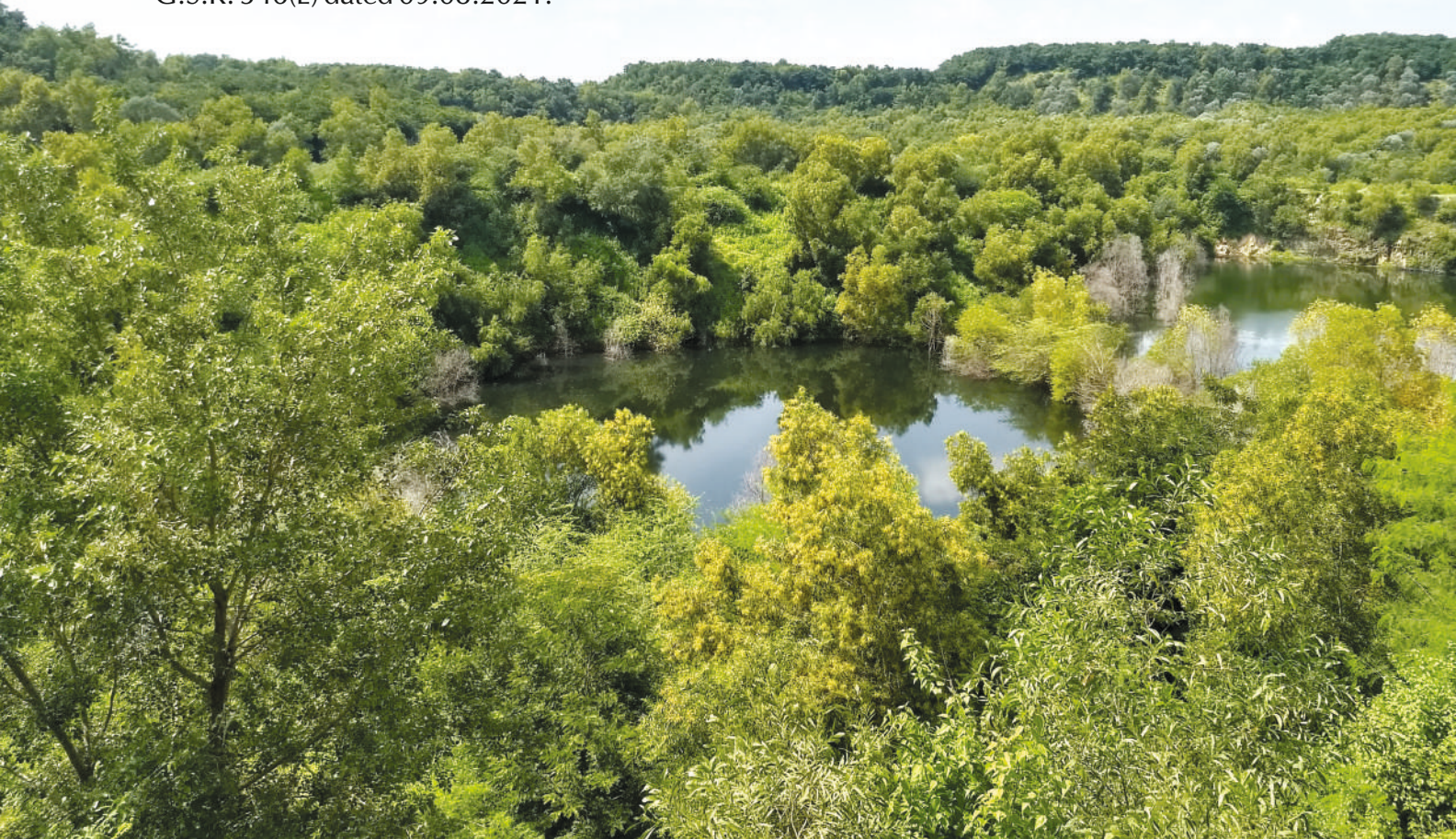
Plantation and rain water harvesting pond at Jamuna Kotma area of South Eastern Coalfields Limited in M.P.

With the objective of scrutinizing the relevance and requirement of various compliances as well as rationalizing, reducing and simplifying the related processes to enhance ease of doing business by doing away parallel compliances, CMCD Act and CMCD Rules have been repealed reducing one Act from the compliance burden and CCR, 2004 have been amended vide Colliery Control (Amendment) Rules, 2021 which have been notified and published in the Gazette of India vide G.S.R. 546(E) dated 09.08.2021.