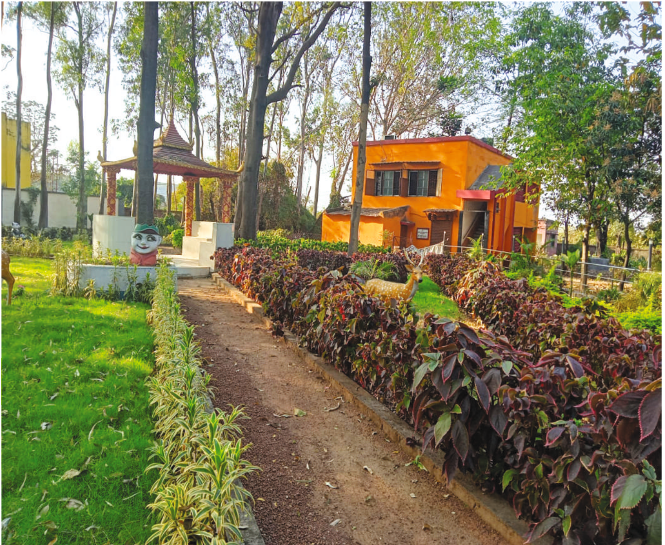
A garden developed in Bankola area of Eastern Coalfields Limited in West Bengal