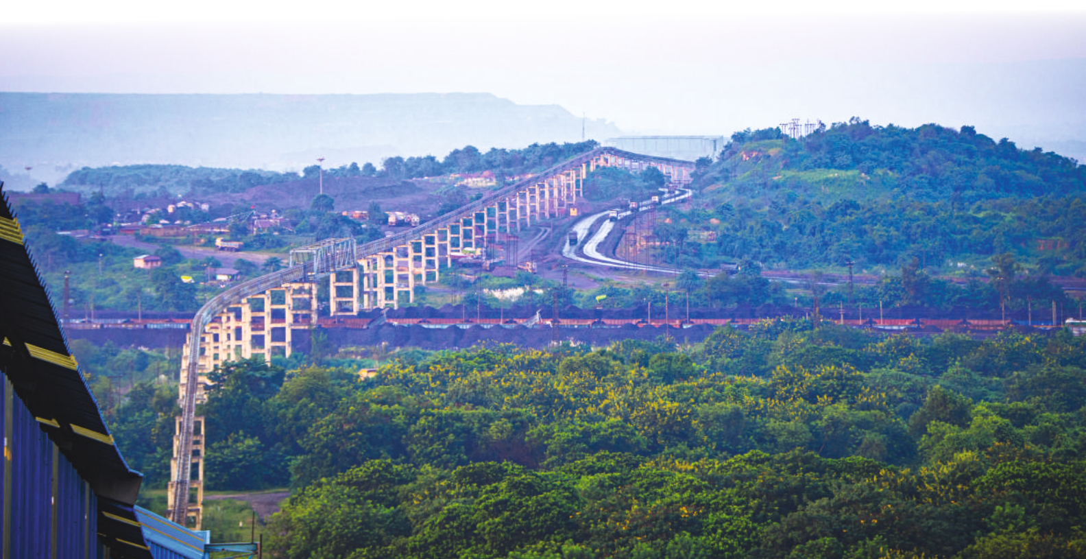
Pipe conveyor for coal transportation being set-up in Talcher coalfields, Mahanadi Coalfields Limited in Odisha