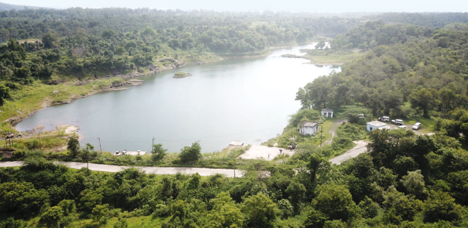
Water harvesting pond created on reclaimed land at NK area of Central Coalfields Limited in Jharkhand