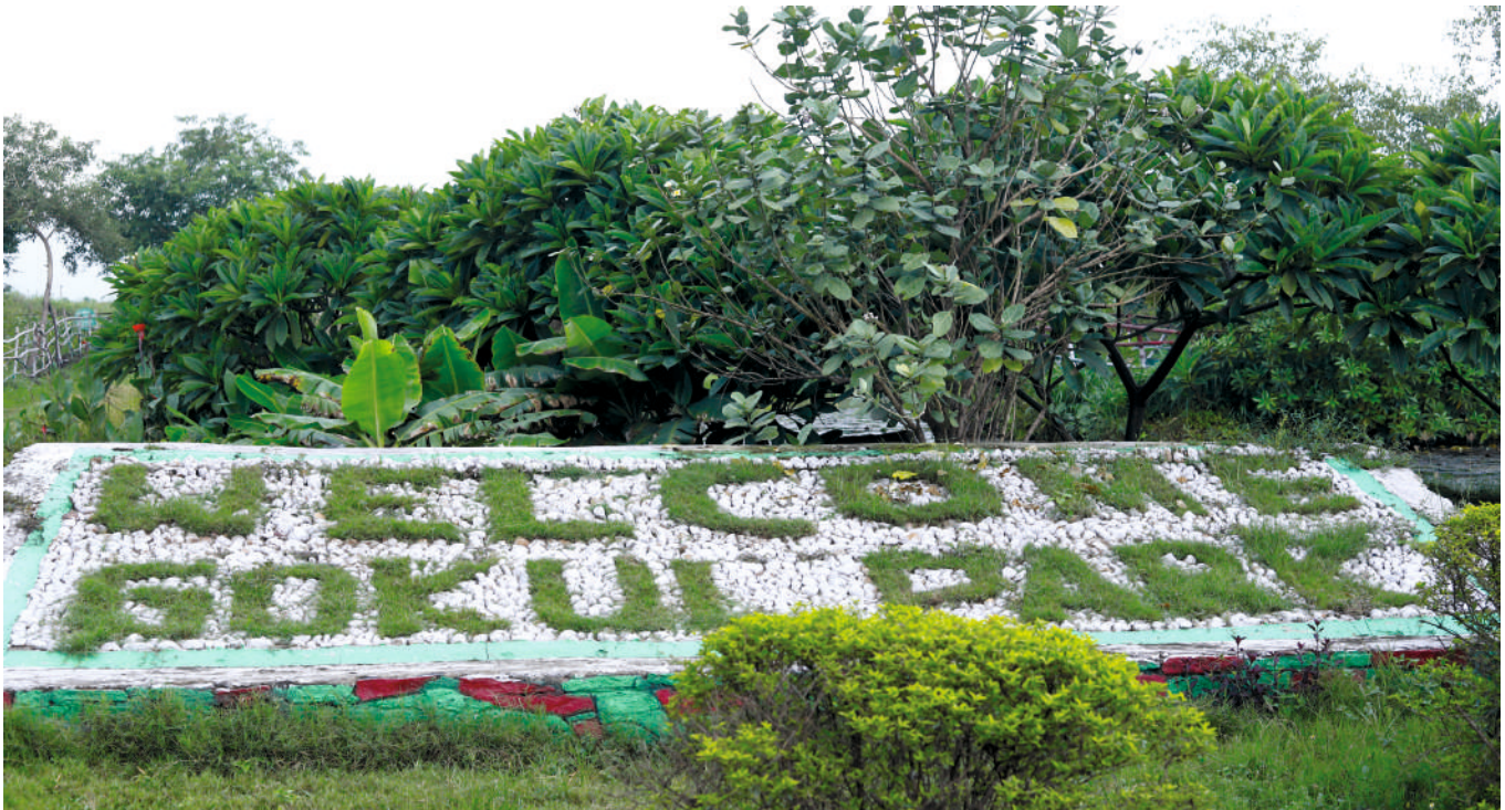
Gokul park at Lodna area of Bharat Coking Coal Limited in Jharkhand