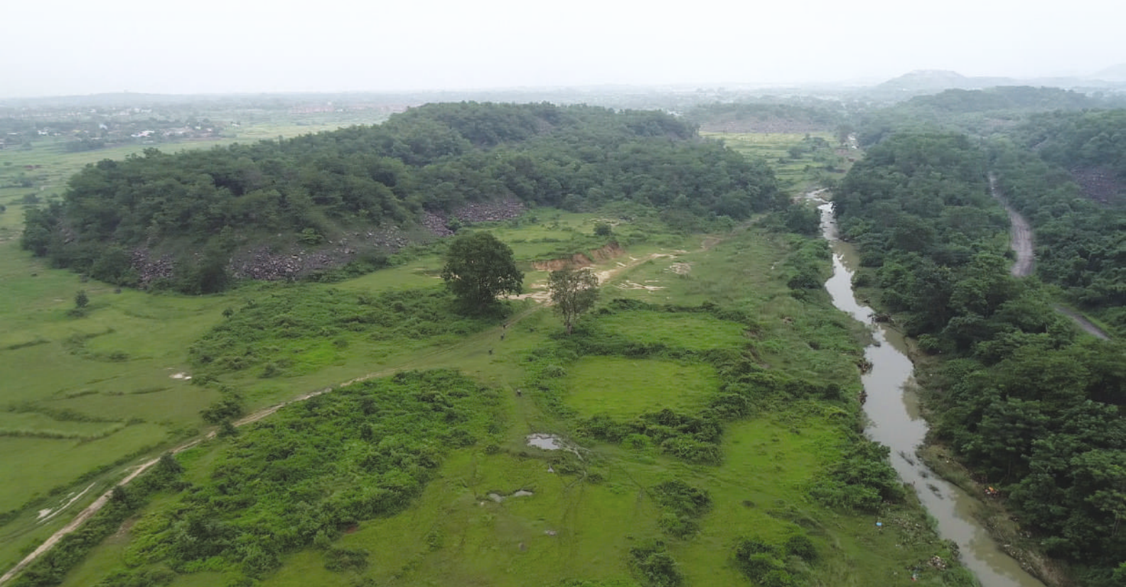
An eco-restoration site at Barora area of Bharat Coking Coal Limited in Jharkhand